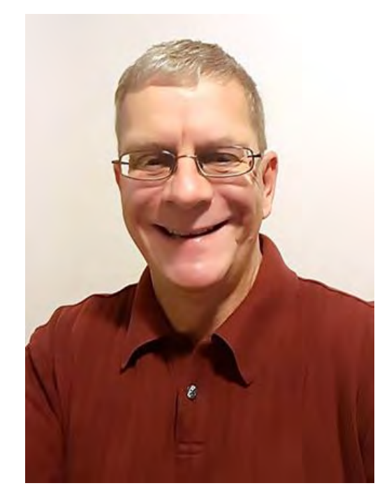
Flos Carmelí – Winter 2017

I am completely committed to our Teresian charism. I believe with all my heart in our vocation to be contemplatives for the Church and for the world. We help to save souls and make the world more humane. I am privileged and blessed to serve you all on the Provincial Council and will serve the best I can with the help of the grace of God.