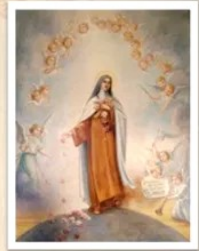
Painting found at the Basilica of the Little Flower San Antonio Texas.

* 24 Glories are prayed (one for each year of the Saint's life)